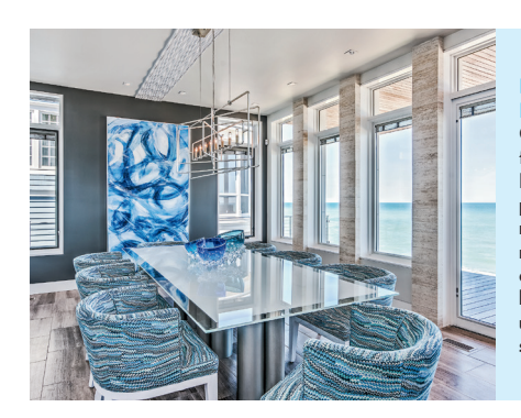
DINING ROOM Grossman found a Kelly O'Neal painting that mirrored the room's wavy details and had it scaled up to fit the space.