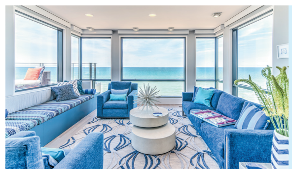
LOUNGE Grossman used eight different fabrics for seating in the bar area, including the bench (at left), which hides ductwork and gas lines.

KITCHEN Three shades of cabinetry keep the room from getting washed out in sunlight. "I had to play with the values to make colors pop on cloudy days," says Grossman.