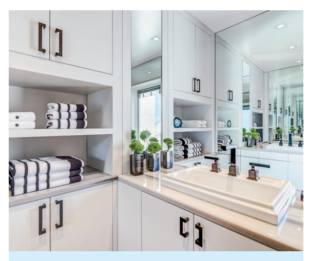
MASTER BATH Mirrored walls give the illusion of space; blue highlights pop among white cabinets and Newport Brass hardware.